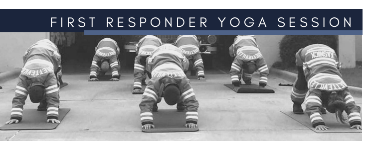
Join us for an introduction to the First Responder Yoga program. No experience (or flexibility) needed!

$100 - Members of the NAWP or IAWP $125 - Non-Members